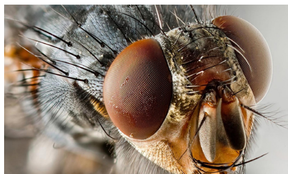
Example images in Full HD